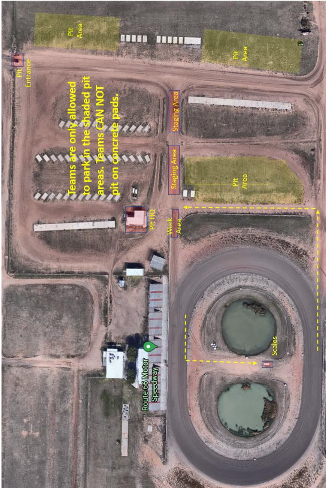
Figure 4. Pit Area