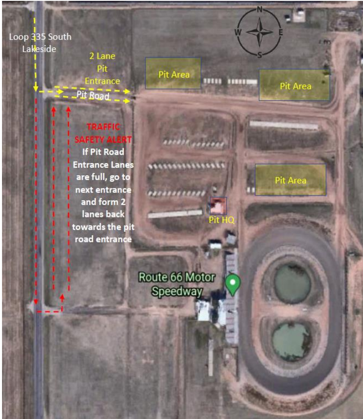
Figure 3. Pit Entrance Procedures