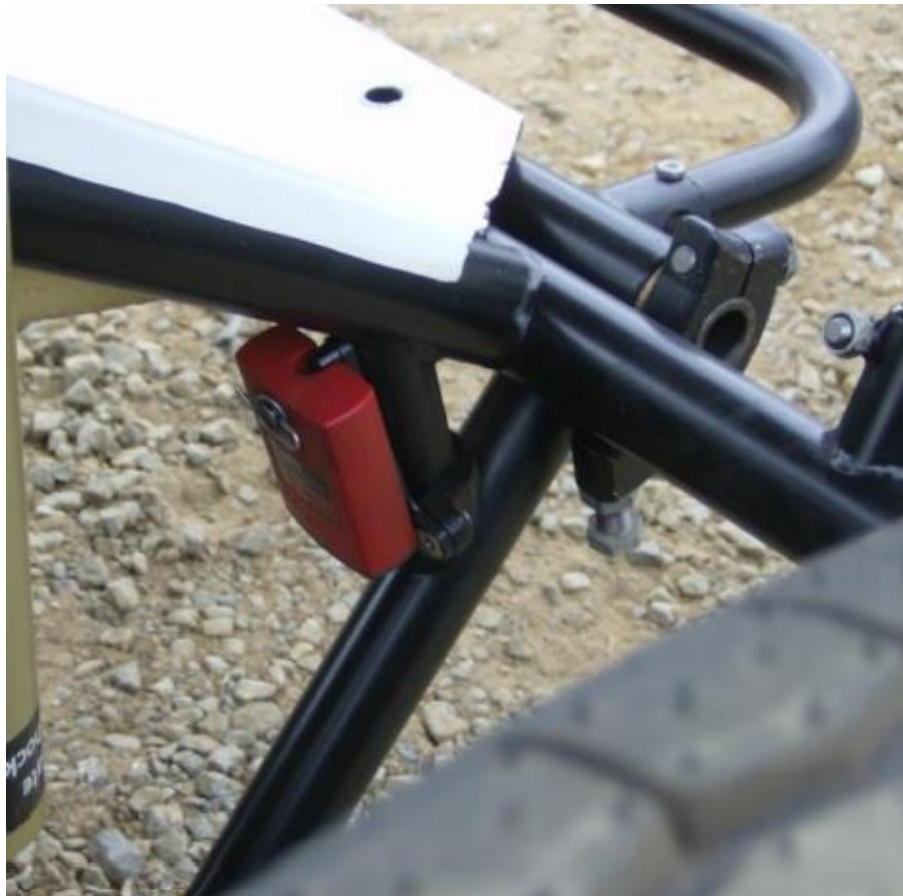
Figure 2. Transponder Location